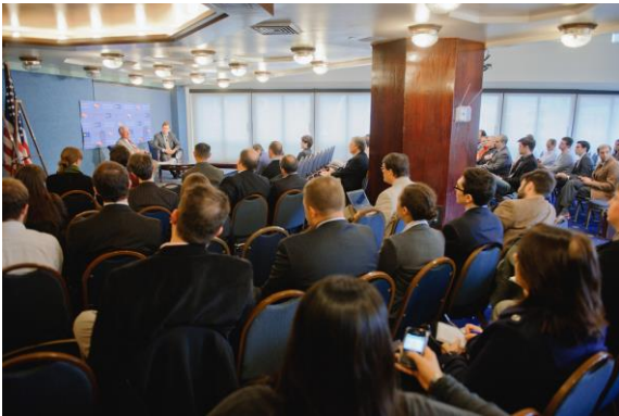
Photo: Workshop in First Amendment Lounge of National Press Club